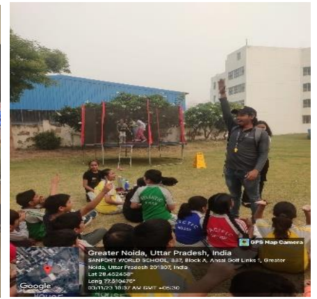
Student teacher participating in different activity